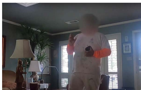
Unlicensed contractor provides bid during August 2021 Sting.

Complaints involving non-egregious misconduct by licensed contractors can often be resolved through mediation by CSLB staff. Most consumer complaints filed with CSLB allege incomplete or defective work. In these cases, CSLB attempts to resolve the dispute and make the consumer financially whole, when appropriate. In 2021, CSLB helped recover more than $27.8 million in restitution and corrected work for consumers—a seven percent increase from the previous year. In 2021, CSLB closed 17,660 complaint investigations.