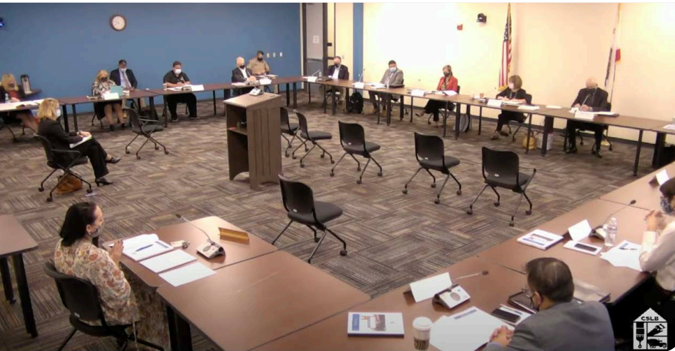
The Board meets in September 2021.